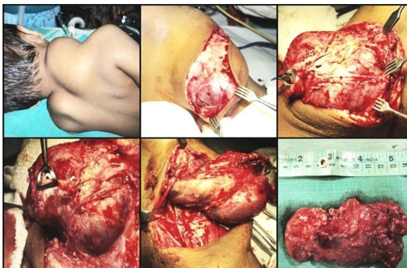
Figure 2. (A) Clinical Photograph Of Patient (B) Horizontal Cervical Incision (C) Flap Elevation & Dissection (D) Relation With Accessory Nerve (E) Dissection Of Cystic Hygroma (F) Post Excision Surgical Specimen

For surgical planning, every patient underwent MRI evaluation which depicted extent of lesion and its relationship with important nerves & vessels. All preoperative evaluations were within normal limits with no evidence of any syndromic associations. All the patients were operated under general anaesthesia with endotracheal intubation which went uneventful except in one patient where the anaesthetist had to use flexible bronchoscope because of the lesion pushing the floor oral cavity up thereby reducing the accessibility of the airway by laryngoscope.